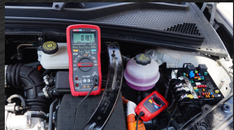
Electrical motor current test