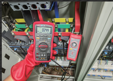
Bus bar current test